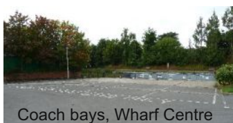
Coach bays, Wharf Centre