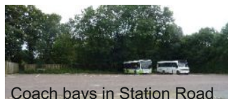
Coach bays in Station Road